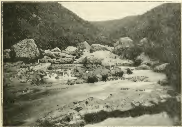
AT THE FOOT OF MOUNT SHILLONG.

so the people began to call him "U 'Lei Shillong" (the god of U Shillong) after the name of the man who first paid him homage. Then gradually he came to be called "the god Shillong," and in time the mountain itself was called the mountain of Shillong, and from this is derived the name of the present town of Shillong.